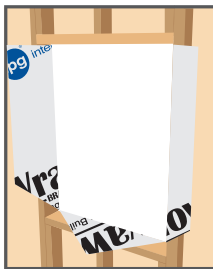
Fold back and fasten to frame